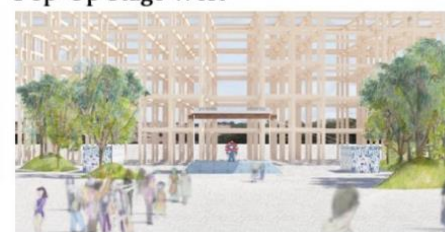
Pop-Up Stage West