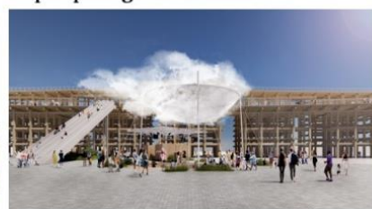
Pop-Up Stage Inner East