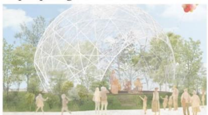
Pop-Up Stage Outer East