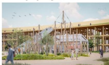
Pop-Up Stage North