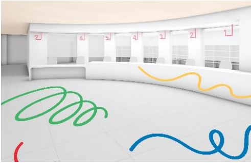
*Concept image of the EXPO2025 WEST Post Office

The concept of the post office is “Play at the Post Office!” In addition to selling exclusive original postage stamps and goods, the post office will also provide customers with hands-on content related to letters that they can play with! Why not write to others about the excitement you felt at the Expo? We look forward to seeing you at the Post Office!